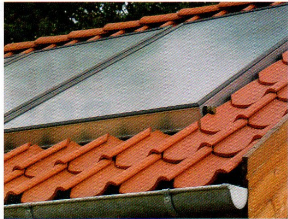
Domestic installations will receive a set annual payment

For the heating industry, installers must be certified under MCS for a customer to be able to access the RHI